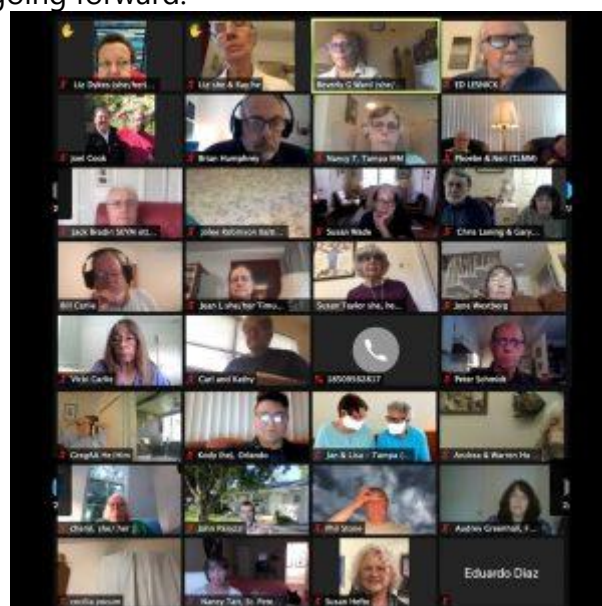
Plenary (partial screens shot)

During this year of social isolation, Friends have taken the opportunity to become more connected with nature, deepening our sense of the need to protect her. We shared our memories and experiences of nature in All Ages Worship Sharing. The songs of birds in our backyards, shared over Zoom, brought the presence of nature into our morning worship. In 'What Now for Earthcare in SEYM,' Friends heard about three critical issues in our region, and considered what actions we can take. There is a lot of enthusiasm to do more work together going forward.