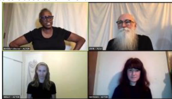
the actors for Playback Theater

In our plenaries and Executive Committee meetings, we learned that some committees have been able to meet online during the pandemic, while others have not. The Peace and Social Concerns committee, which meets monthly on Zoom, has seen an increase in participation. Our Field Secretary for Earthcare has been very active, with virtual visits to Meetings, giving presentations, and connecting with a myriad of Quaker organizations, environmental organizations, and interfaith groups. We were inspired by hearing the latest news from visiting representatives from AFSC, FCNL, FGC, and Quaker House. We adopted a minute , brought forward by the Committee for Ministry on Racism, to support the establishment of a Truth and Healing Commission on Indian Boarding Schools. We also heard sad news that a member, who attended our YM many years ago, was arrested for sexual abuse of a minor. While we know of no incidents within our Yearly Meeting, we spent time carefully discerning how to respond to this news and care for any who may have been subject to abuse as children.